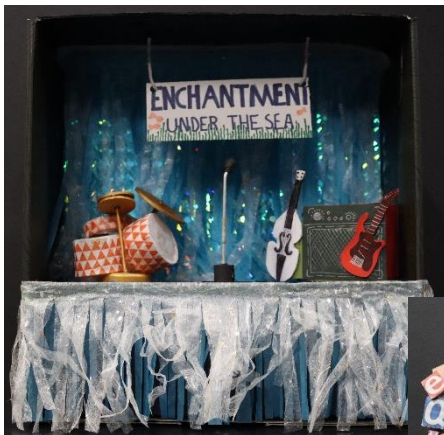
Esme C – back to the Future

GCSE students have been looking at stage and set design & we wanted to share with you some of the remarkable results of this . Do take a look at the following shoebox model sets: