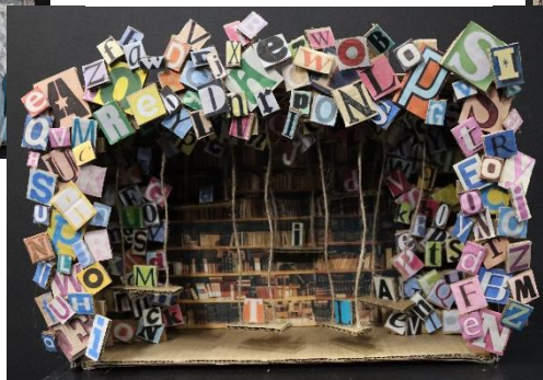
Izzy W - Matilda