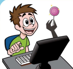
A Parent's Guide to Online Grooming