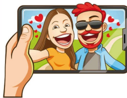
A Parent's Guide to Sharing Pictures