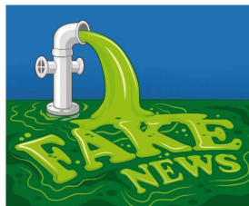
A Parent's Guide to Fake News