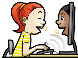
A Parent's Guide to Social Media