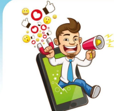
A Parent's Guide to Live Streaming

scan the QR code with your phone's camera to see the guides on our website