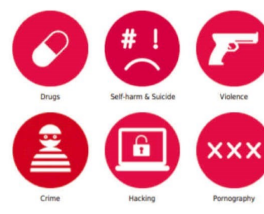
A Parent's Guide to Privacy Settings