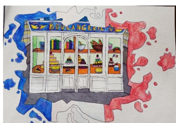
1st Place Emmylou Crozer 8 Green

After careful consideration we have chosen our top three.