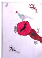
2nd Place Florence Cole 8 Orange