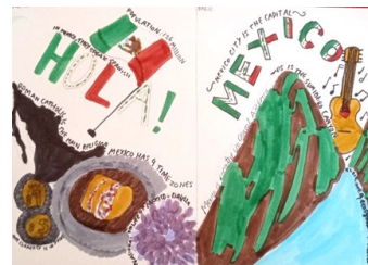
3rd Place Evelyn Vickers-Currey 8 Red

All entrants will receive a certificate and a positive SIM, third place 3 positive SIMS, second 5 positive SIMS.