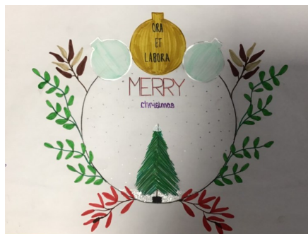
Commended Lily Dallimore 9 Orange