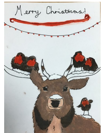
3rd Place Tian Chan Sing 7 White